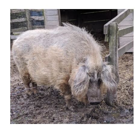
We currently have options for KS1 and KS2. KS3 and 4 groups are welcome to contact us to discuss an education visit.

We can't wait to help your group experience the Dark Ages!